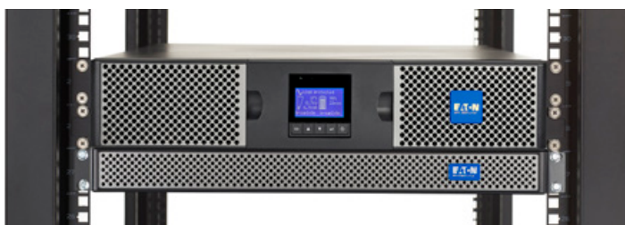
2U UPS with 1U EBM in 4 post rack

*Battery and labor cost for one replacement